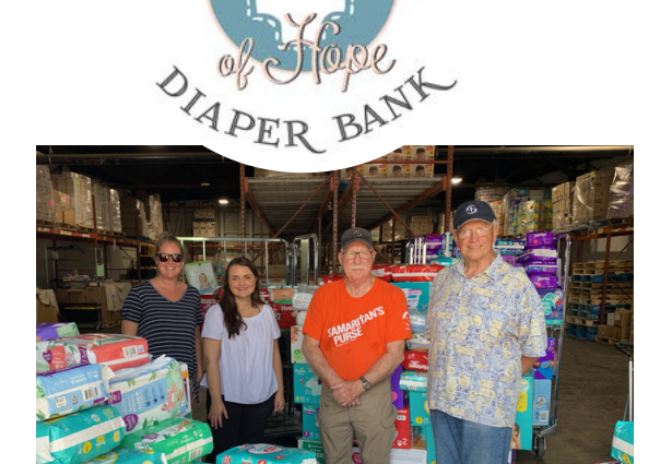
Asbury volunteers delivering diapers to Bundles of Hope Warehouse.

For the month of May, we will be collecting gently used tennis shoes and nonperishable foods for OMM. Dates to note are: May 9 & 25, Oak Mountain Missions Serve Day on location | May 15, 10:00 AM Senior Serve Day at OMM | May 30, Donation Delivery Day. Contact Brooke Wolde at brooke.wolde@asburybham.org.